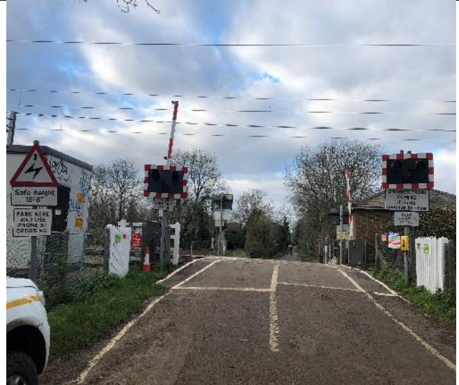
Upside crossing approach.

The level crossing is located on Fen Road. The road approach speed is estimated to be Less than 30mph.