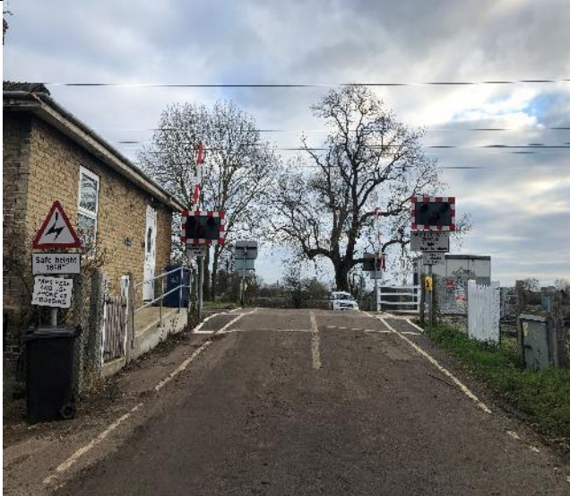
Downside crossing approach.