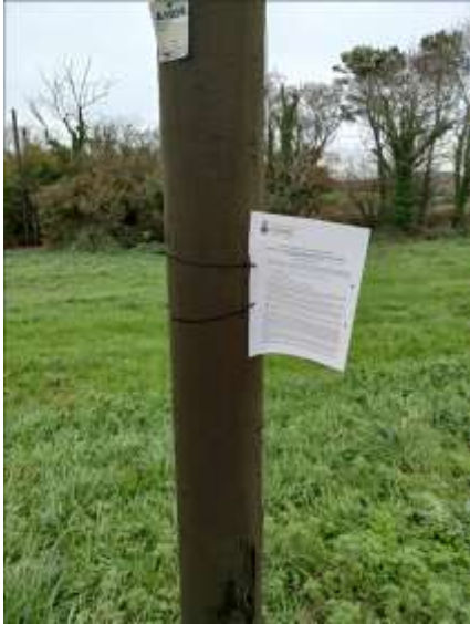
SRO SITE NOTICE 1