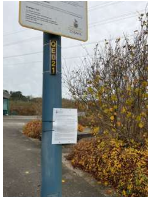
CPO SITE NOTICE 10