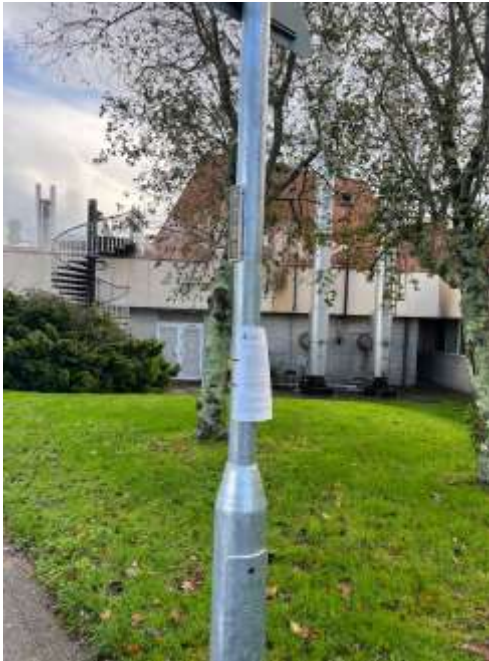
CPO SITE NOTICE 19