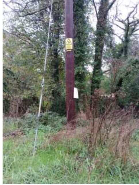
CPO SITE NOTICE 18