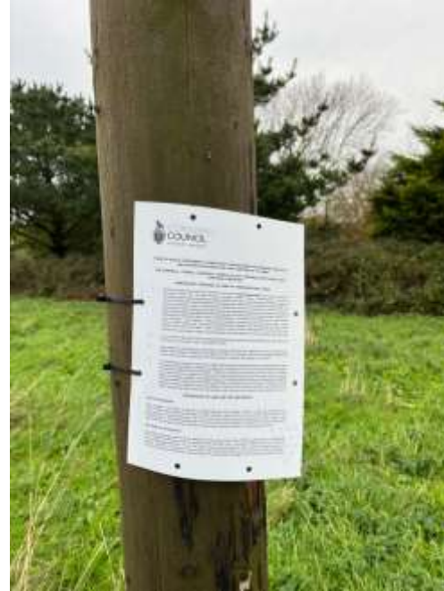
CPO SITE NOTICE 2