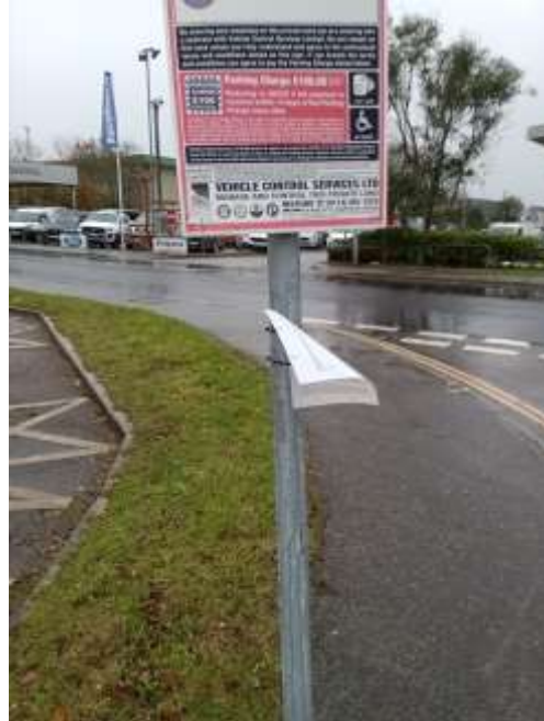
CPO SITE NOTICE 22