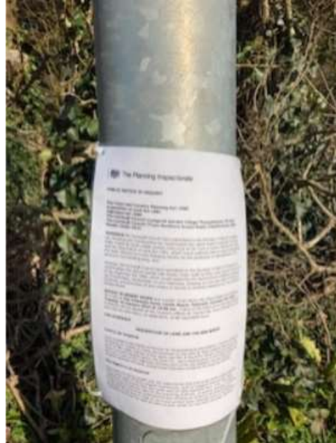
PUBLIC INQUIRY SITE NOTICE 2