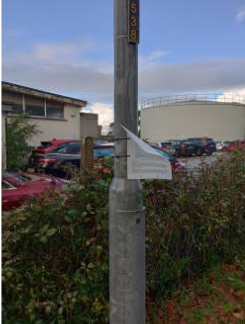
CPO SITE NOTICE 21