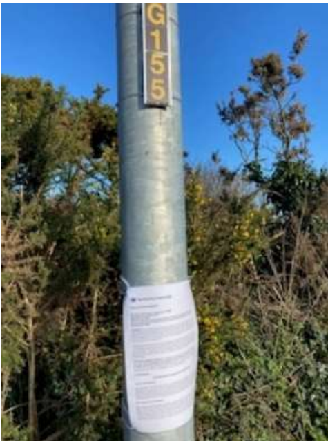
PUBLIC INQUIRY SITE NOTICE 3