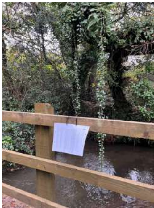
CPO SITE NOTICE 15