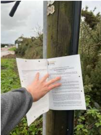
SRO SITE NOTICE 3