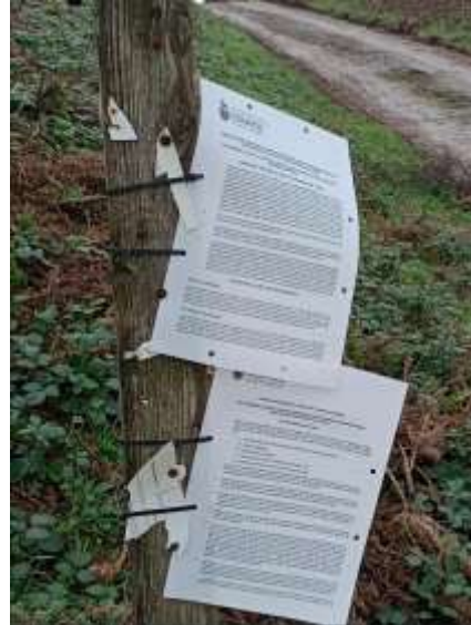
SRO SITE NOTICE 2