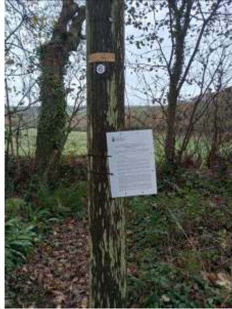
SRO SITE NOTICE 6