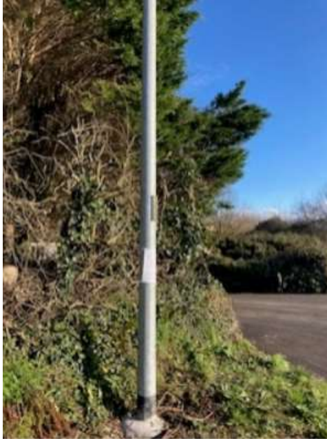
PUBLIC INQUIRY SITE NOTICE 1