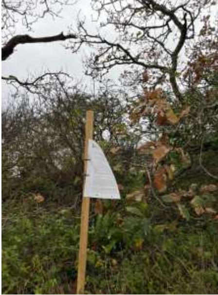
SRO SITE NOTICE 5