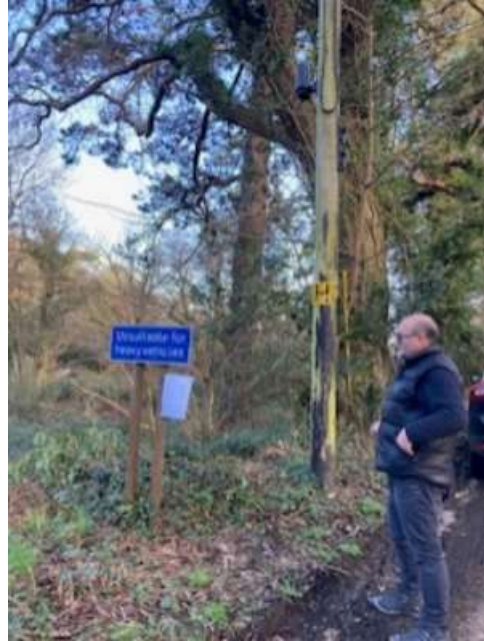
PUBLIC INQUIRY SITE NOTICE 14