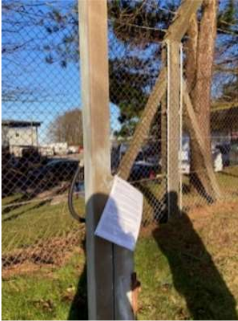
PUBLIC INQUIRY SITE NOTICE 17