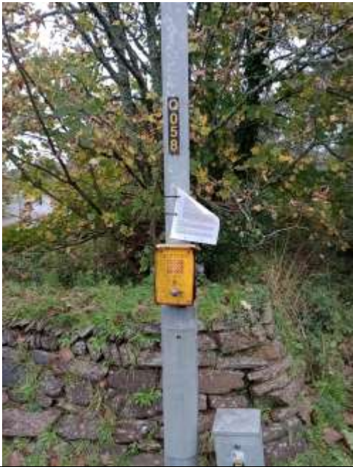
CPO SITE NOTICE 7