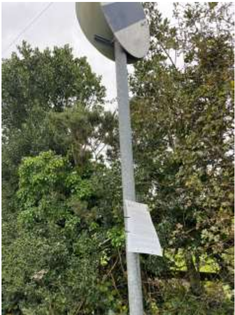
CPO SITE NOTICE 11