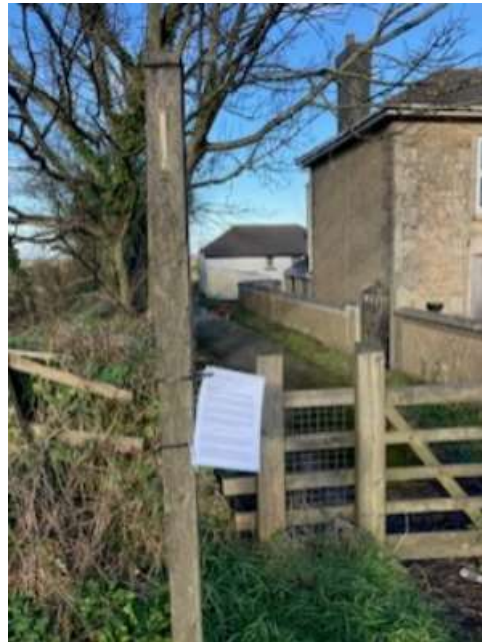
PUBLIC INQUIRY SITE NOTICE 10