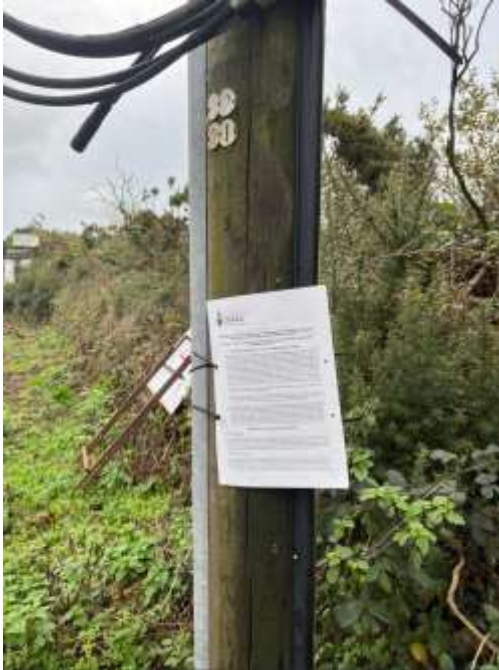
CPO SITE NOTICE 5