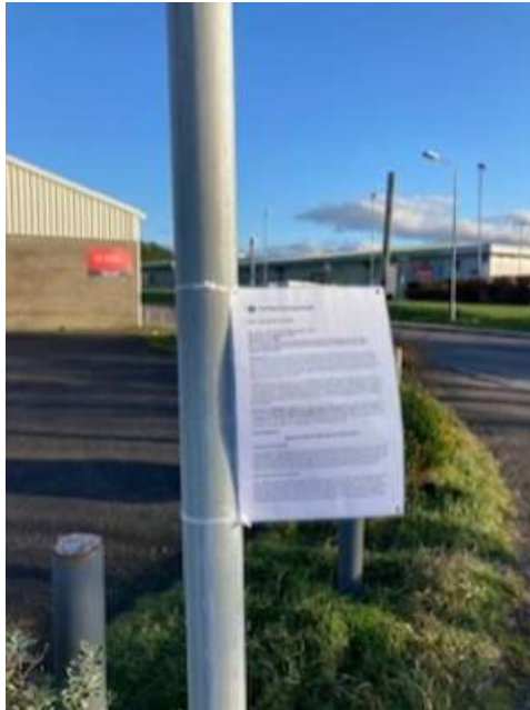
PUBLIC INQUIRY SITE NOTICE 19