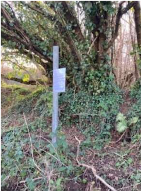
PUBLIC INQUIRY SITE NOTICE 15