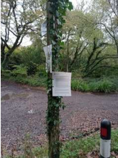
CPO SITE NOTICE 17