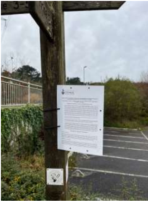
CPO SITE NOTICE 9