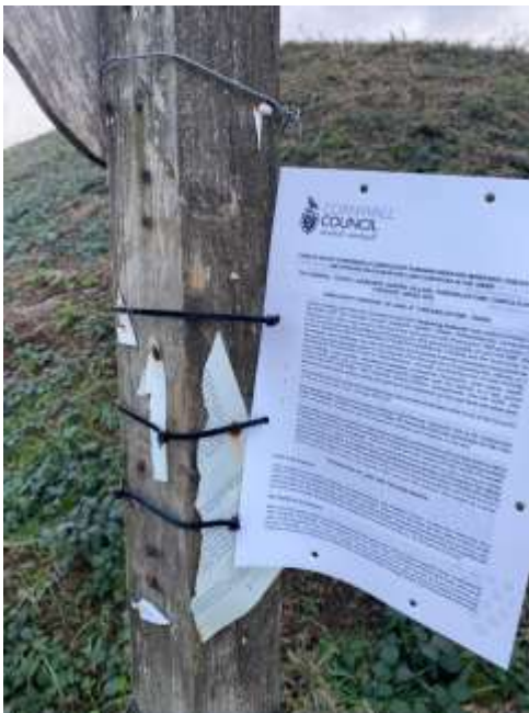
CPO SITE NOTICE 3