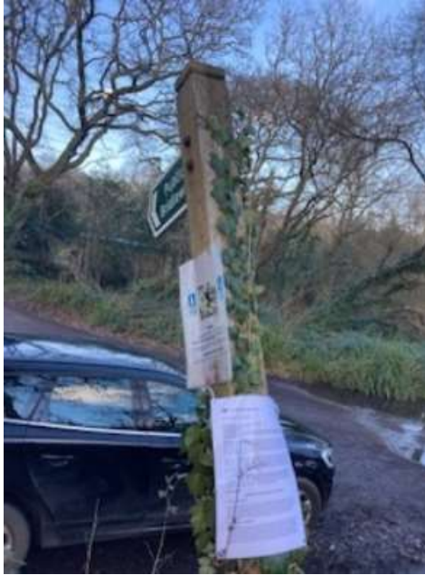
PUBLIC INQUIRY SITE NOTICE 13