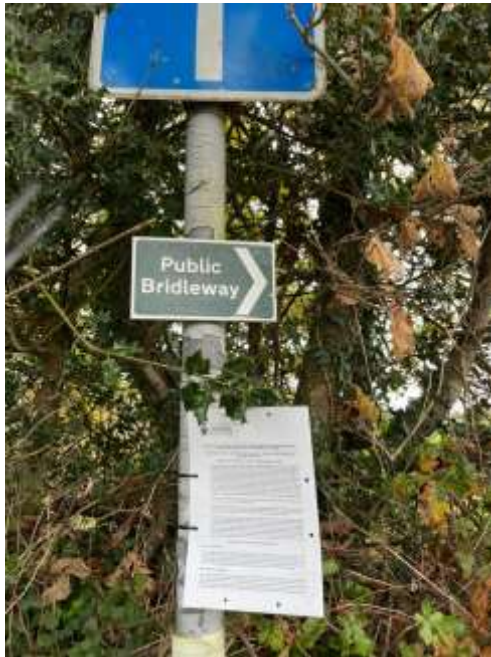
CPO SITE NOTICE 13