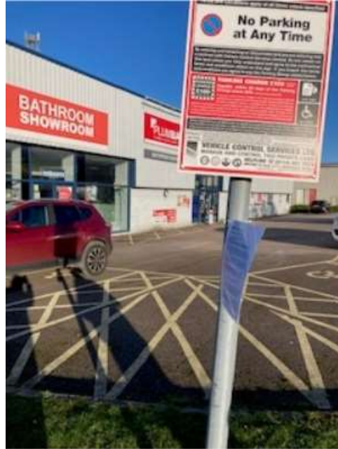
PUBLIC INQUIRY SITE NOTICE 18