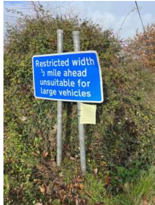
CPO SITE NOTICE 14