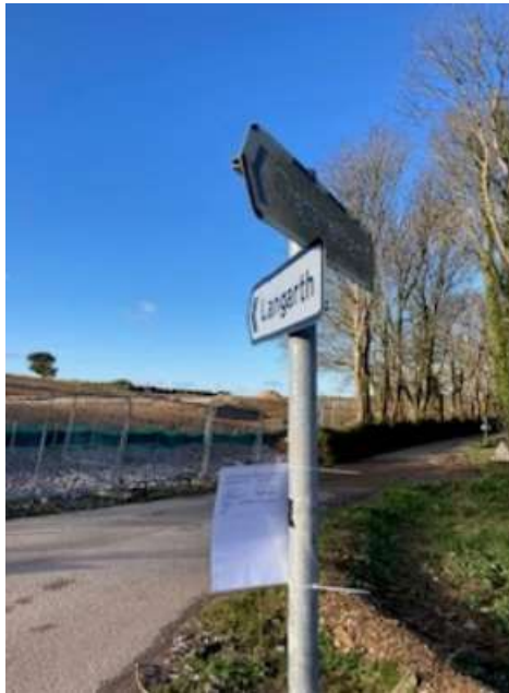
PUBLIC INQUIRY SITE NOTICE 9