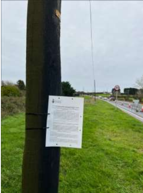
CPO SITE NOTICE 1