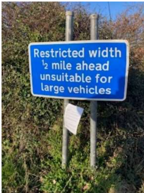
PUBLIC INQUIRY SITE NOTICE 11