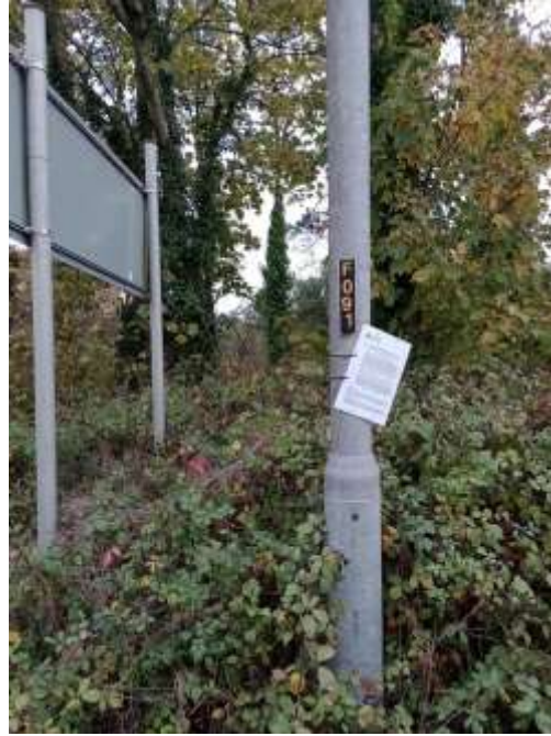
CPO SITE NOTICE 6